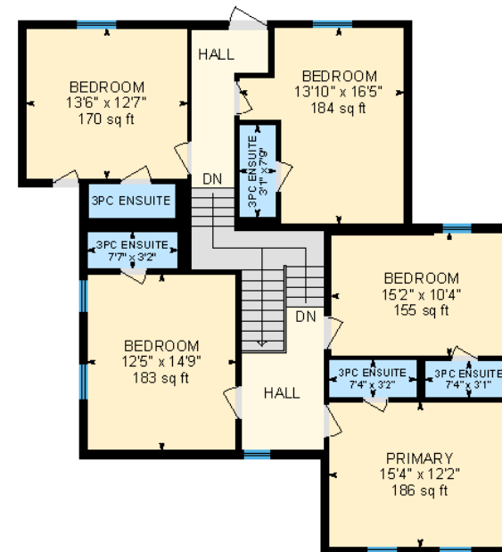
2nd Floor Exterior Area 1401.49 sq ft